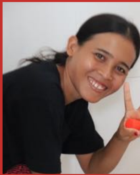
TEP SREY NEAR